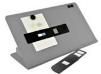
Fixed angle & tilting tables

To optimise consistency of viewing conditions the CAC range incorporates a specially selected white reflector, a neutral matt grey interior finish and a unique VeriVide control panel, which gives the user access to a variety of advanced features including: servicing indicator, auto sequence, warm up, power save and a data storage facility.